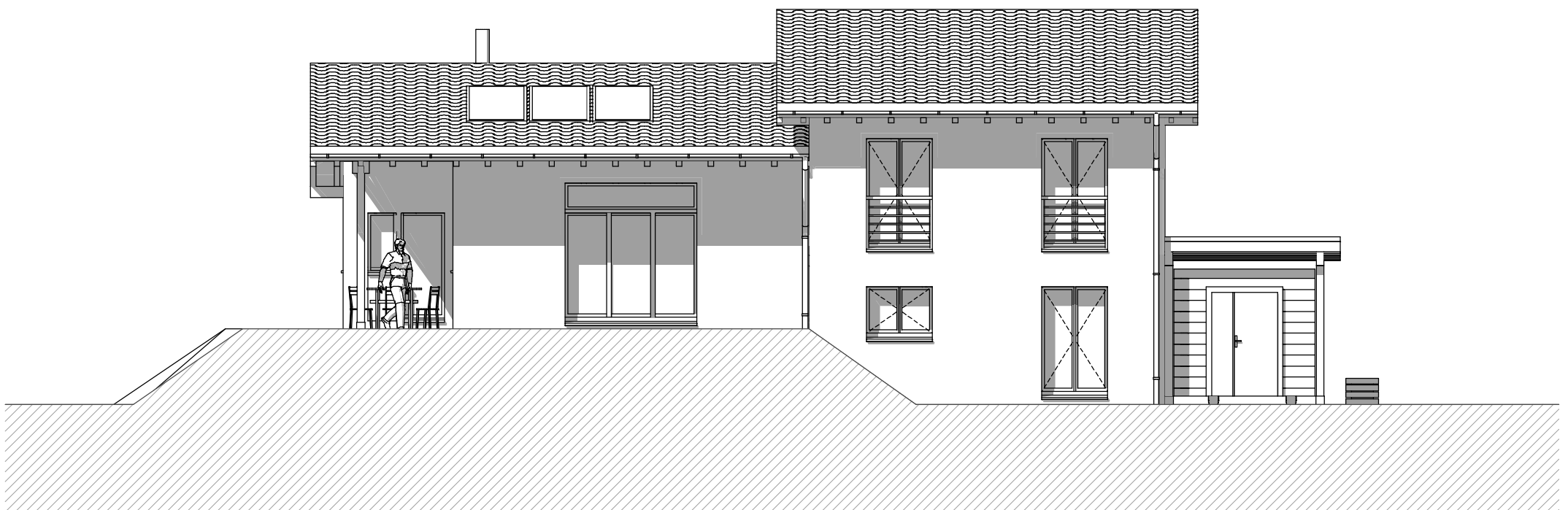
ELEVATION SUD 1:100